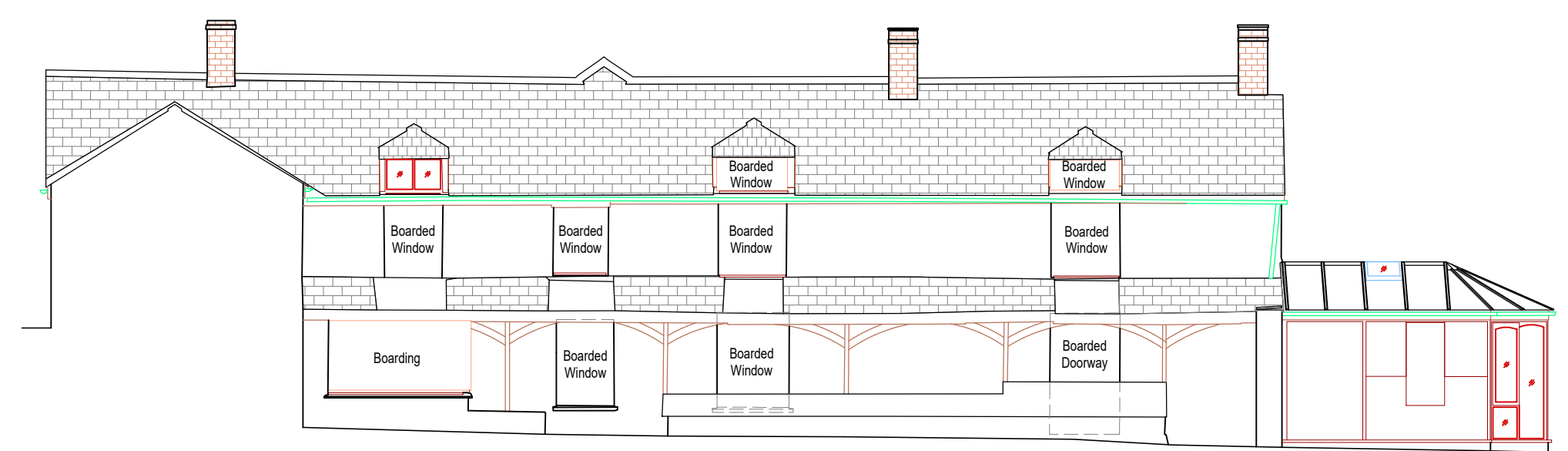
Datum 0.00m A.O.D. South Elevation

This survey has been produced at the surveyor's sole discretion and shall only be used for the original intended purpose. Any scaling should only be undertaken using a suitable metric print produced using the original data. The printed scale may differ from the electronic version of the survey data. It is for the use only of the party to which it has been addressed and no responsibility is accepted by any third party for the whole or part of its contents. This survey has been prepared on the basis that all information and facts which may affect the survey, have been disclosed to Nuplan by the parties concerned and no liability or responsibility can be accepted unless full disclosure has been made. All ground features that were visible at the time of the survey have been located, however there may have been items obscured. Pipe sizes and flow direction have been visually assessed from the surface and should be considered as approximate only. All data remains in the ownership of Nuplan and any discrepancies between this survey and any other information should be reported to Nuplan. Nuplan is the trading name of Nuplan Surveys Ltd, a limited company registered in England No. 0762200. Registered address: 2 Church Street, Trewartha, Par, Cornwall PL24 2QG