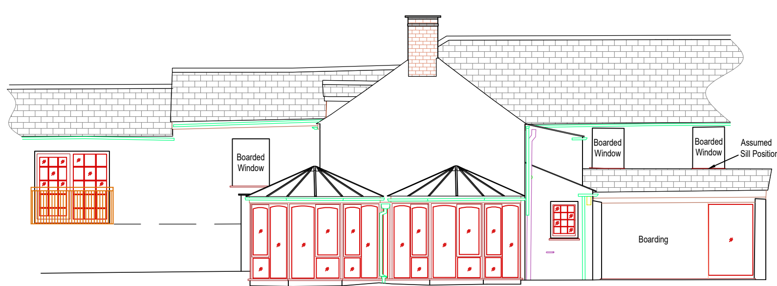
Datum 0.00m A.O.D. East Elevation